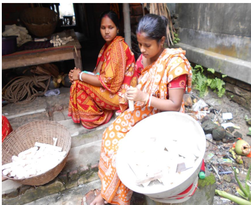
Photos showing – Dryflower artisans in action in Mandir Bazar location in South-24 Pargana district under AHVY Supported project on cluster development programme of Office of the Development Commissioner (Handicraft), Government of India.