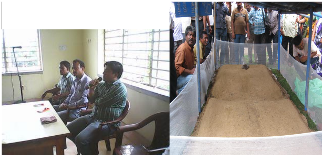
Photos showing: Orientation cum demo on vermicomposting in one of the Gram Panchayat in Burdwan.