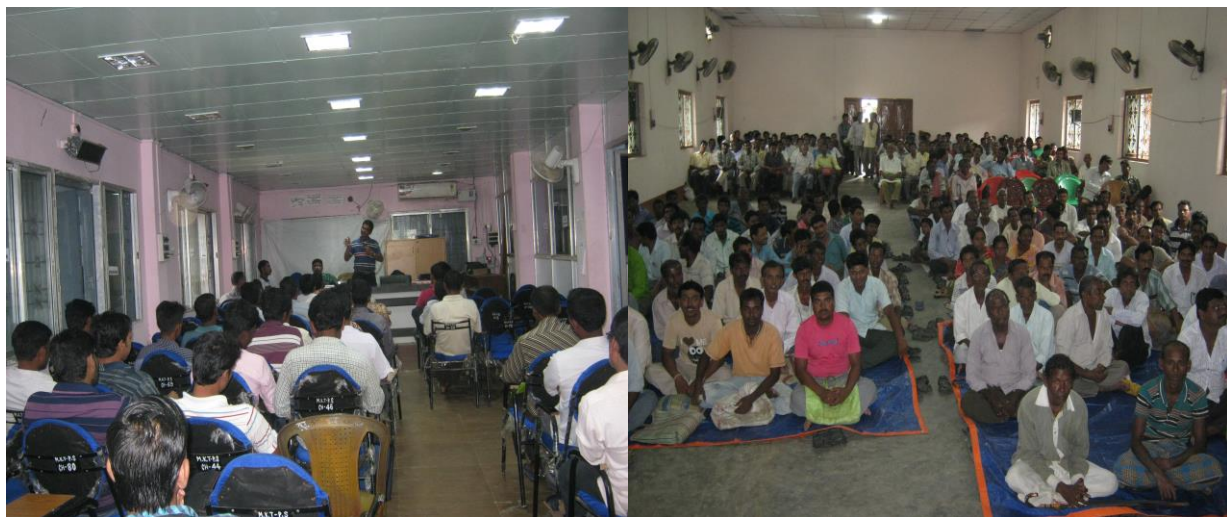
Photos showing: Orientation on vermicomposting in one of the Block in Burdwan, selected beneficiaries listening to the contents of orientation on vermicomposting.