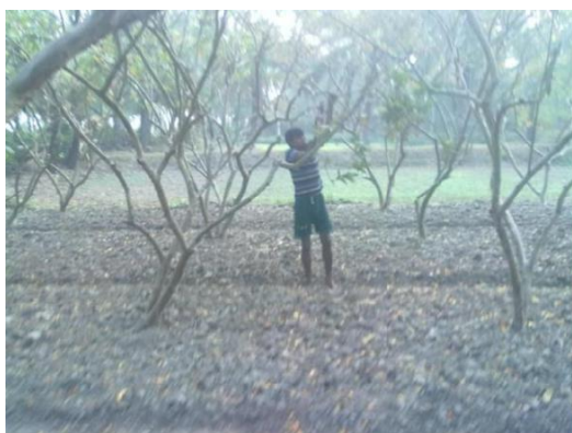
Ex-trainee Asis Kapat maintaining Guava plantation at Patharpratima Block in South-24 Pargana district of West Bengal.